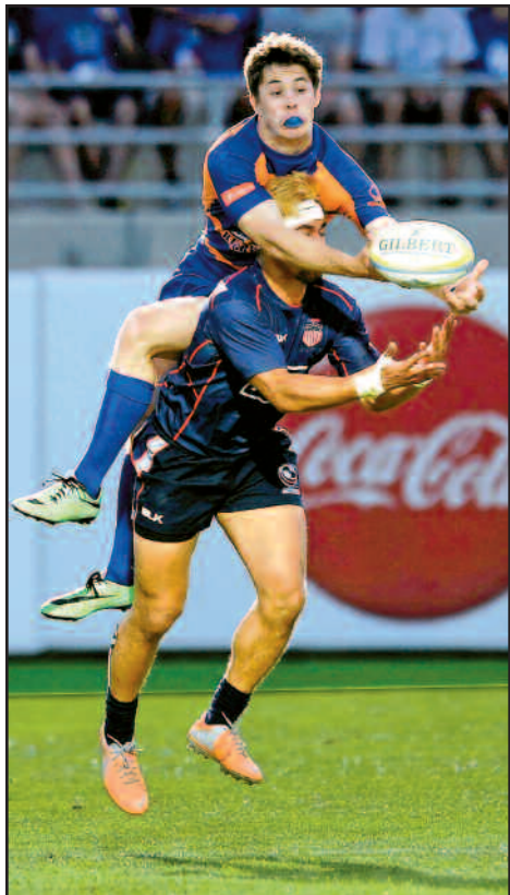
The USA Falcons, a team made of USA National Team players, outlasted the Denver All-Stars in 2014 to win the Serevi RugbyTown Sevens tournament.

compete in Pool B alongside the Bermuda National Team, Stars Rugby 7s and Upright Rugby Rogues. Pool C will feature locals Denver All-Stars, newcomers Atlantis Rugby, Northeast Olympic Development Academy and Mexico Serpientes National Team. Rounding out the tournament field in Pool D are the Serevi Selects, Texas-based Negro y Azul, Collegiate All-Americans, and the Bahamas National Team.