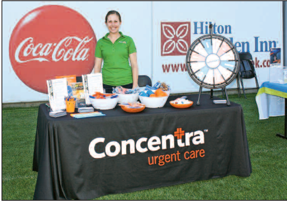
Concentra Urgent Care sets up at Monday Movie Madness during the summers at Infinity Park to interact and educate the community.