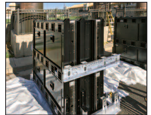
Daktronics crews install the hi-res digital video boards at Infinity Park.