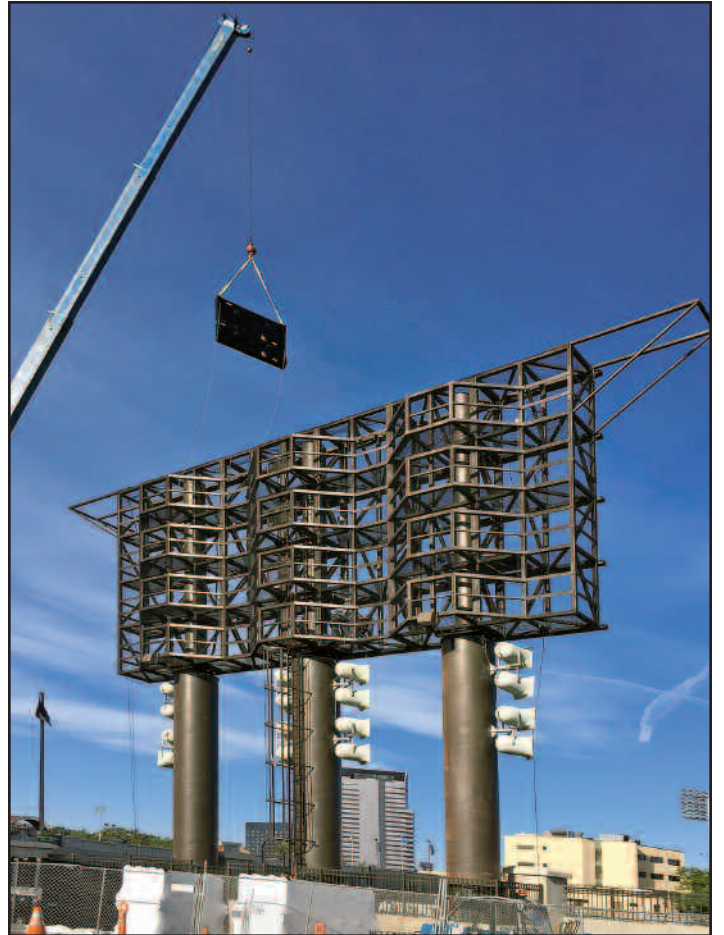
A crane lifted jumbo screen components onto the larger frame as part of the installation process.

All that new space will enhance the in-game experience for fans and will give advertisers more value for their sponsorship dollars. Instead of a static sign with a company logo printed on it, like the ones that surrounded the old video screen, the new video screen will be able to have moving logos, will be able to incorporate sponsors